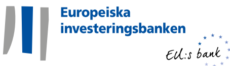
Three colour version (shown in Swedish)