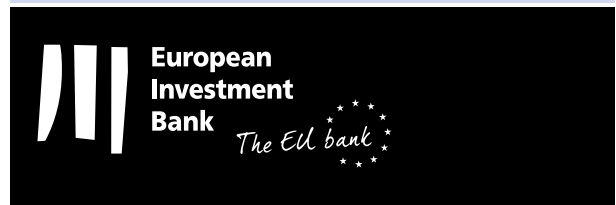
Negative version (shown in English) allowed if use of basic version is impossible