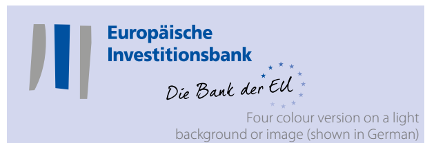
Four colour version on a light background or image (shown in German)